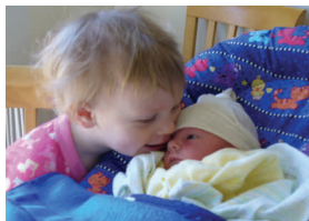
Marena loves her little sister— sometimes!

Again, this is a temporary schedule, and we expect Sue will be able to see more patients per day again in the very near future, and that she will eventually be able to be in the office three or four days per week. Thank you for your patience as we work through some bumps in the road while we try to get back to a “normal” schedule for seeing patients! ■